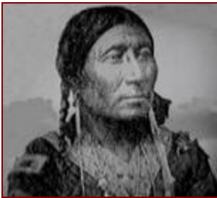
Chief Black Hawk